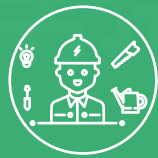
IN-HOUSE PLUMBER, ELECTRICIAN, GARDENER, CARPENTER & PEST-CONTROL ON CALL