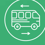
AC BUS SERVICE TO & FROM THAKURPUKUR, JOKA & TOLLYGUNGE METRO STATIONS