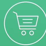
MULTIPLE CONVENIENCE STORES