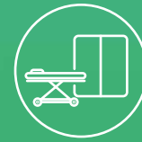
STRETCHER LIFT IN ALL RESIDENTIAL BUILDINGS