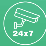
24 HOURS GATED SECURITY WITH CCTV