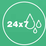
24 HOURS FILTERED WATER SUPPLY