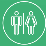
COMMON WASHROOMS ON GROUND FLOORS