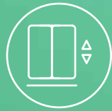
HIGH SPEED LIFTS