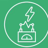
STANDBY GENERATOR FOR POWER LOAD TO APARTMENTS