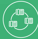
INTERCOM CONNECTIVITY THROUGHOUT THE PROJECT