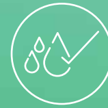
SEWERAGE TREATMENT PLANT