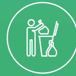
DEMARCATED AREA FOR GARBAGE DISPOSAL