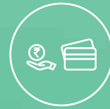
SPACE FOR BANK & ATM