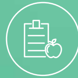
IN-HOUSE DIETICIAN CHAMBER