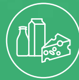
EXCLUSIVE UNADULTERATED FRUITS/VEGETABLES & DAIRY OUTLET