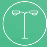
WELL-LIT INTERNAL ROADS