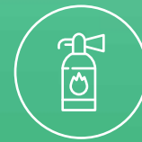
STATE-OF-THE-ART FIRE SAFETY